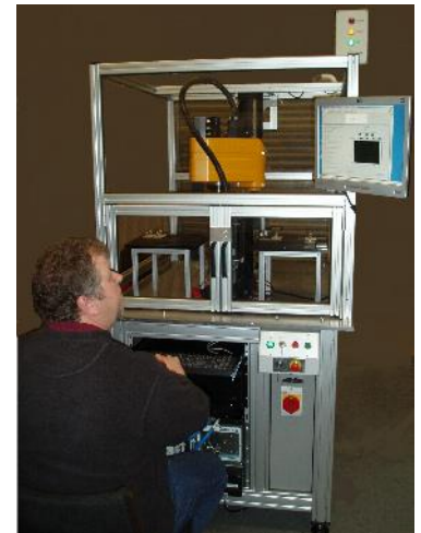
Robotic PV Cell Machine

A 6 x 6 array tray was manually located at the input station. A vacuum based pick & place system then transferred a single product to the test station. Electrical connection to the PV cell was then made and the dark iv curve was produced, using a high current source meter, under blacked out conditions. The next test was to produce the light iv curve using a 10 ms flash test from a high intensity flash unit that was calibrated, each use, by a standard reference cell. The current generated by the PV cell was then measured using a 0.01 Ohm resistor. Data generated was acquired by a high speed NI DAQ card. Passed components were transferred to the tray at the output station and reject components back to the input tray and marked as reject.