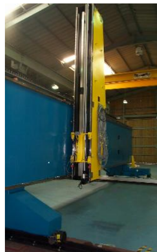
Inverted Traverse During Assembly