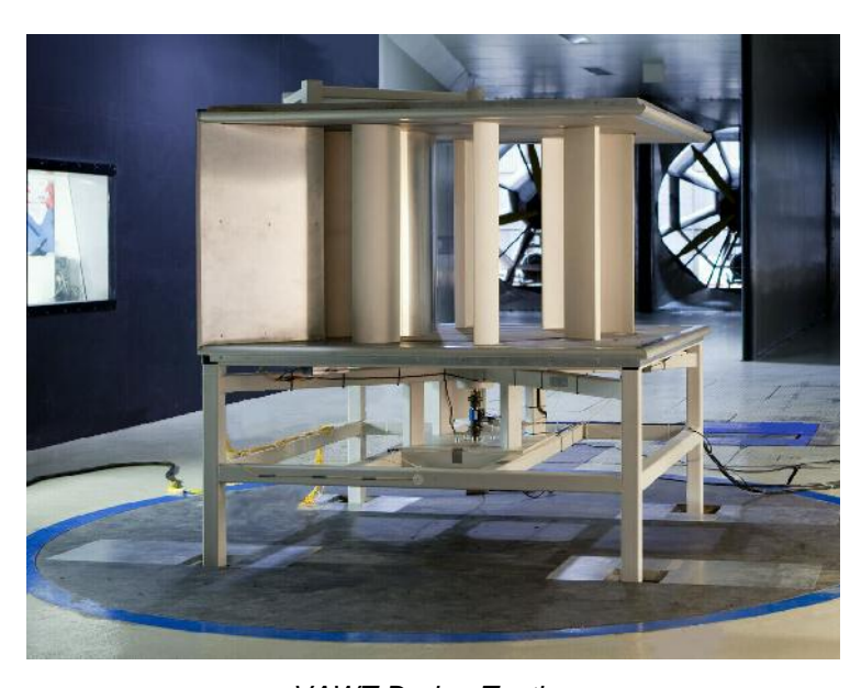
VAWT During Testing