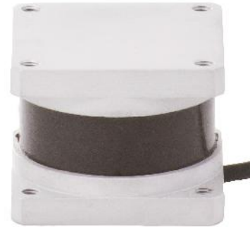
Square 3 Axis Sensor

The 3 axis square and cylindrical sensors are built around a single 3D hemispherical sensor that is sandwiched between two plates of either a square or cylindrical format available in metal or ABS. The sensor is an optical based force sensing system, utilising four photodiodes to measure the amount of reflected light emitted by an LED, permitting measurement of the X,Y and Z forces acting upon the sensor. The hemispherical sensor is mounted to a PCB that is housed within a silicone dome which is completely void of air, providing superior protection to the sensor internals and subsequently allowing substantial overloading above and beyond the stated nominal capacities for each of the axis. The internal hemispherical sensor is mounted to the base plate and further layers of silicone are applied between the two plates, creating the visible external appearance.