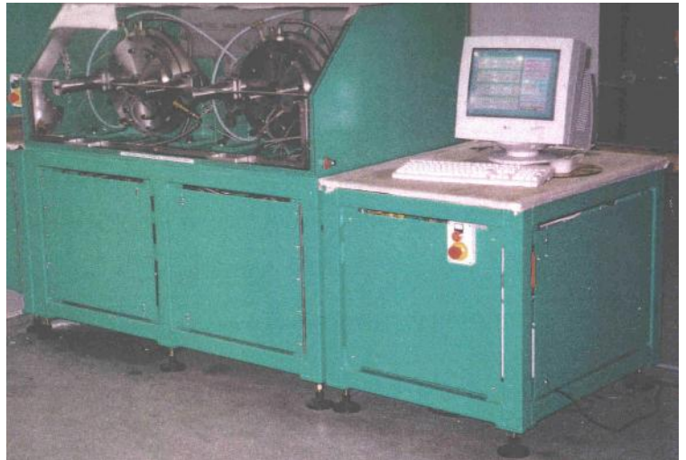
Seal Test Rig

One or two 180 mm diameter seals can be tested in each head (for load balance), up to a temperature of 170 deg C and pressure of 160 bar, by a unique oil recirculation system. All parameters for each head could be independently set and controlled via the PC.