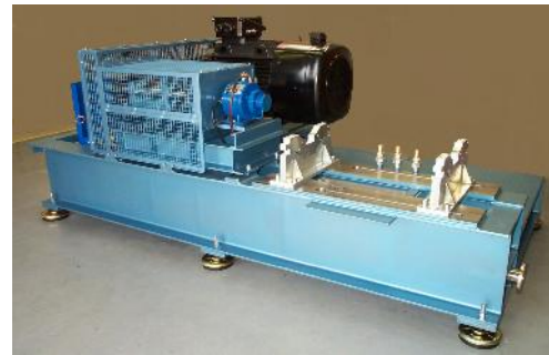
High Speed Seal Rig

Ancillary equipment includes a 200 Nm torque transducer, a 3 pump water cooling system for the seal chamber and oil lubrication system for the gearbox.